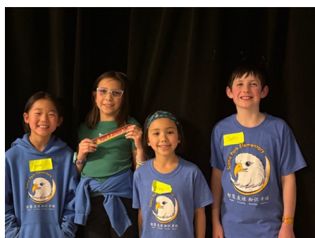
3rd /4th Grade Team 48