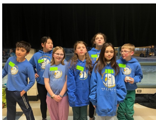
5th Grade Teams