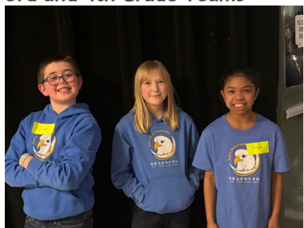
3rd / 4th Grade Team 48