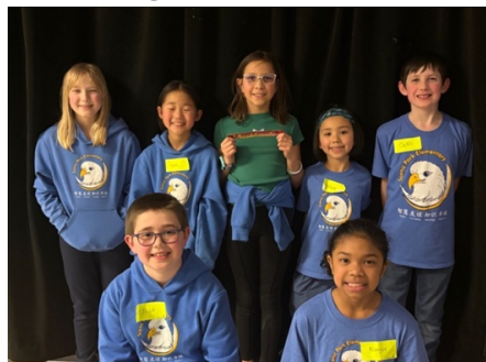
3rd and 4th Grade Teams